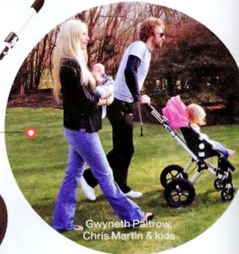
Gwyneth Paltrow, Chris Martin & kids